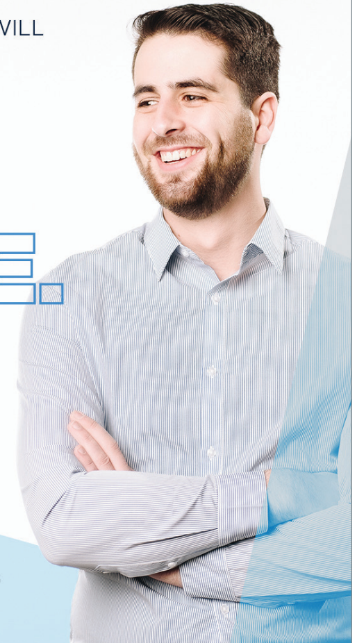
Social Media (Instagram): MBA Programs